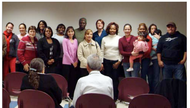
Scholarship winners came together to meet college representatives and to celebrate their new opportunities.