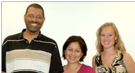
Some music faculty who are also Wind Symphony members.

Young musicians will take center stage in January at the kick off for the spring School of the Arts season. On Jan. 24, Brookhaven College School of the Arts and the Dallas Wind Symphony will partner to bring high school musicians from across North Texas to the college for a Student Chamber Music Festival. Woodwinds, brass and percussion